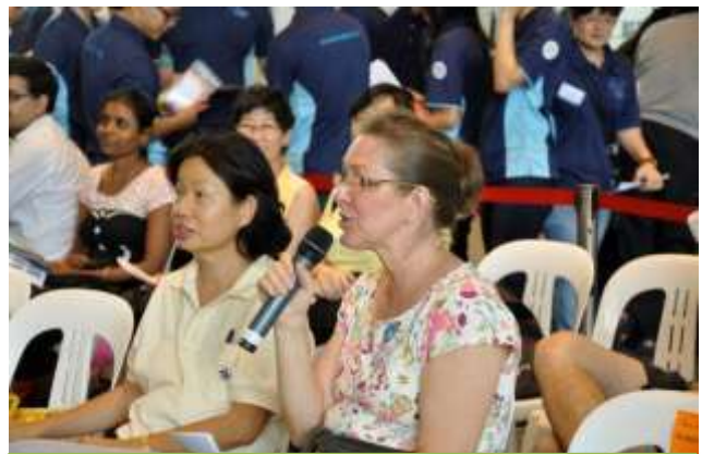
A public asking a question.