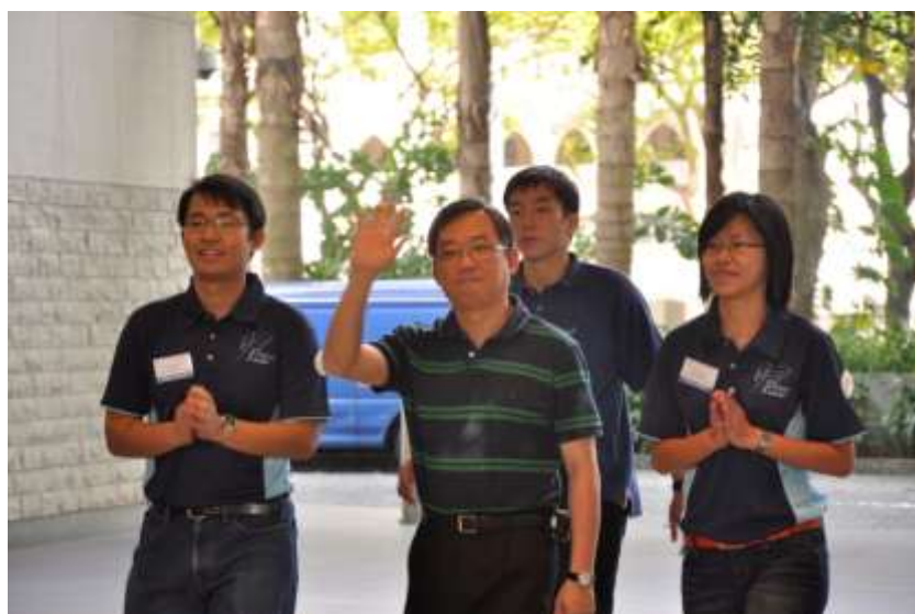
Arrival of Guest –of- Honor, Mr Gan Kim Yong, Minister for Health.

The theme for the roadshow this year was “Promoting Health through Physiotherapy” with the aim of highlighting the role of physiotherapists in the prevention of disease and disability. Mr Gan Kim Yong, Minister for Health graced the occasion as the Guest-of-Honor and joined in the opening demonstration of Tai Chi by physiotherapists.