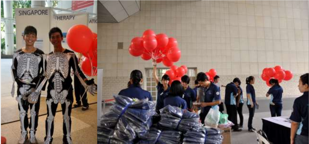
The Event Mascots and Student Volunteers

We would like to express our appreciation to Lee Foundation, who has continuously supported our efforts and funded this community outreach event. Our warmest thanks to the Health Promotion Board, Curtin Singapore and the other sponsors and supporters, without which this event would not had been possible. To NCSS, MediaCorp and Radio 93.8Live, who have made publicity of event to the general public possible. To the hospitals, private practitioners and NYP students, thank you for your participation. Hope all of you did have fun.