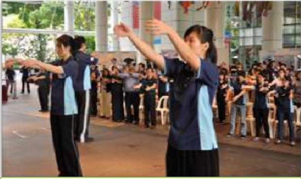
Tai Chi Demonstration from TTSH Physiotherapists