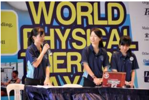
Public Forum – panel of speakers, physiotherapists from various hospitals

A public forum on “Exercise and hypertension, hyperlipidemia and hyperglycemia” in both English and Mandarin drew active participation from the audience while a strengthening exercise session with resistive band attracted an enthusiastic crowd.