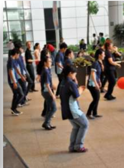
Line dancing led by the Country Line Dance Association of Singapore

2011 is a special year for physiotherapy in Singapore as it also marks the 70 th year physiotherapy has come to its shores. With the rapidly ageing population and rise in chronic illnesses, moving forwards, the local physiotherapy community continues to promote physical activity and exercise, thus keeping the population as healthy, mobile and independent as able.