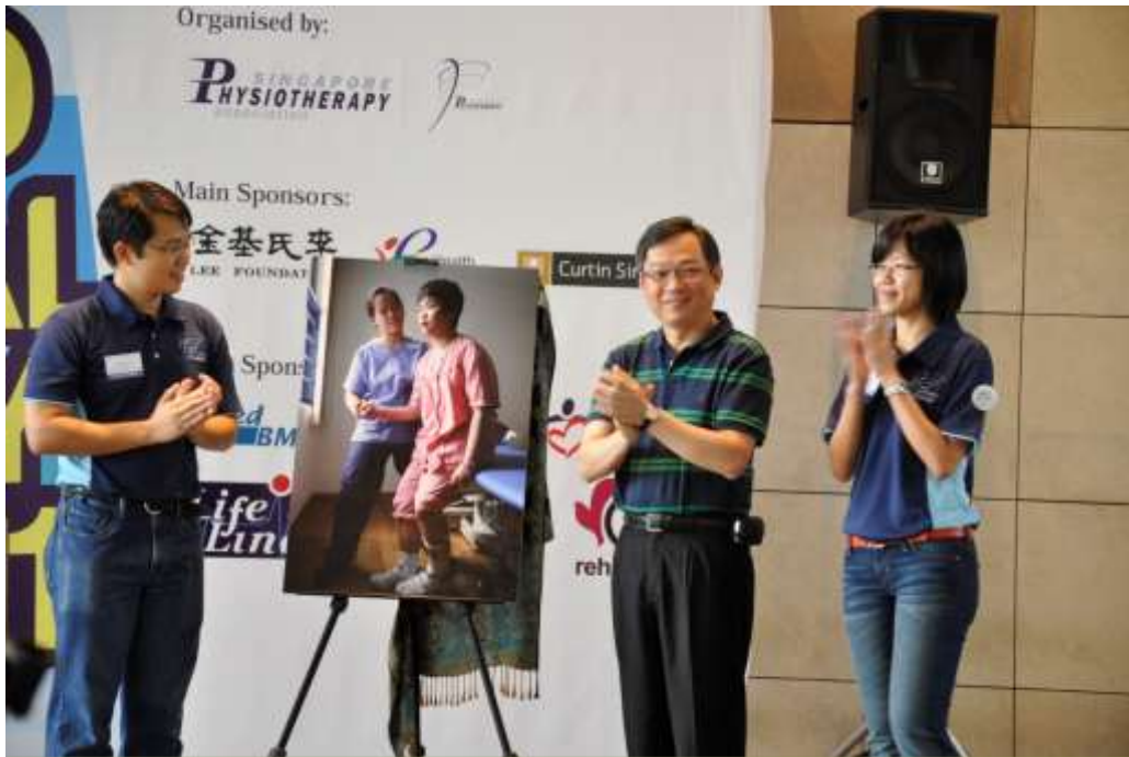
Officiating the Opening Ceremony – unveiling the winning photograph of the Photography Competition