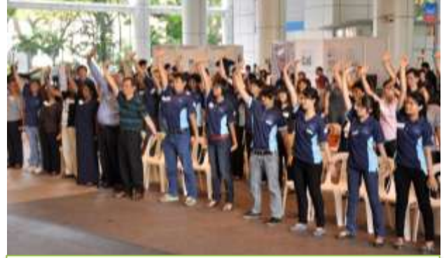
Participation from the audience.

A public forum on “Exercise and hypertension, hyperlipidemia and hyperglycemia” in both English and Mandarin drew active participation from the audience while a strengthening exercise session with resistive band attracted an enthusiastic crowd.