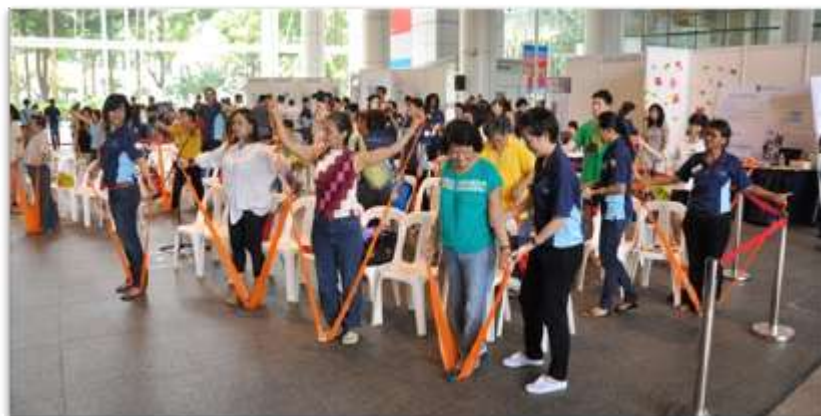
Participants taking part in the resistive band exercise session, guided by physiotherapists and students.